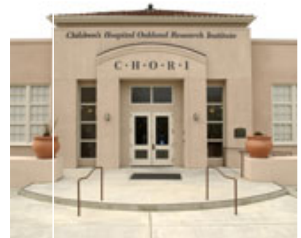
Entrance to Children's Hospital Oakland Research Institute: The building once housed University High School and has been restored.